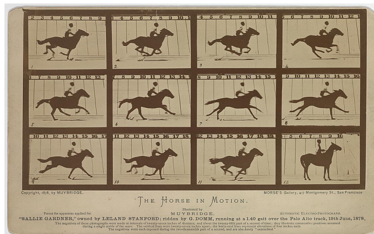
Figure 2: “The Horse in Motion.” Sallie Gardner, owned by Leland Stanford. Palo Alto, CA, 19 June 1878. Eadweard Muybridge. Photographic print on card. US Library of Congress.