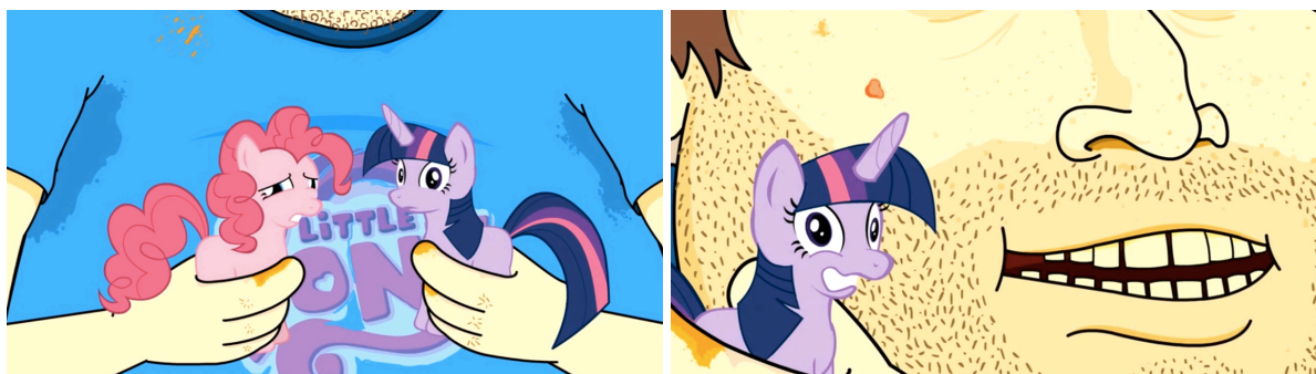
Figures 3 and 4: Pinky Pie and Twilight Sparkle find themselves captives of a stereotypical, Cheeto-eating Brony (left); and Twilight Sparkle is the unwilling object of adult Brony affection (and unkempt stubble) (right) in the Funny Or Die parody “My Little Brony: Friendship is Tragic”. CollegeHumor , 2012. Screenshots.

And, indeed, one recurring concern that the Brony fandom constantly polices is the potential for eroticisation of children’s toys, children’s programming and, by extension, children themselves. Images of MLP:FiM blow-up dolls and plushies—some of them made by Bronies themselves as part of the creativity licensed and encouraged by this “participatory” fandom (Jenkins)—met with anxiety when publicised on the Internet. Bronies engage in a wide range of prosumer practices as they create familiar outputs such as fan fiction, artwork, music and laser light shows at Bronycon and also go farther, to “rework biblical narratives using characters and images from MLP: FiM ” (Crome 400). Bronies, like many fan communities in convergent media culture take seriously the promise of fandom as a “permanent outlet for their creative expression” (Jenkins 42).